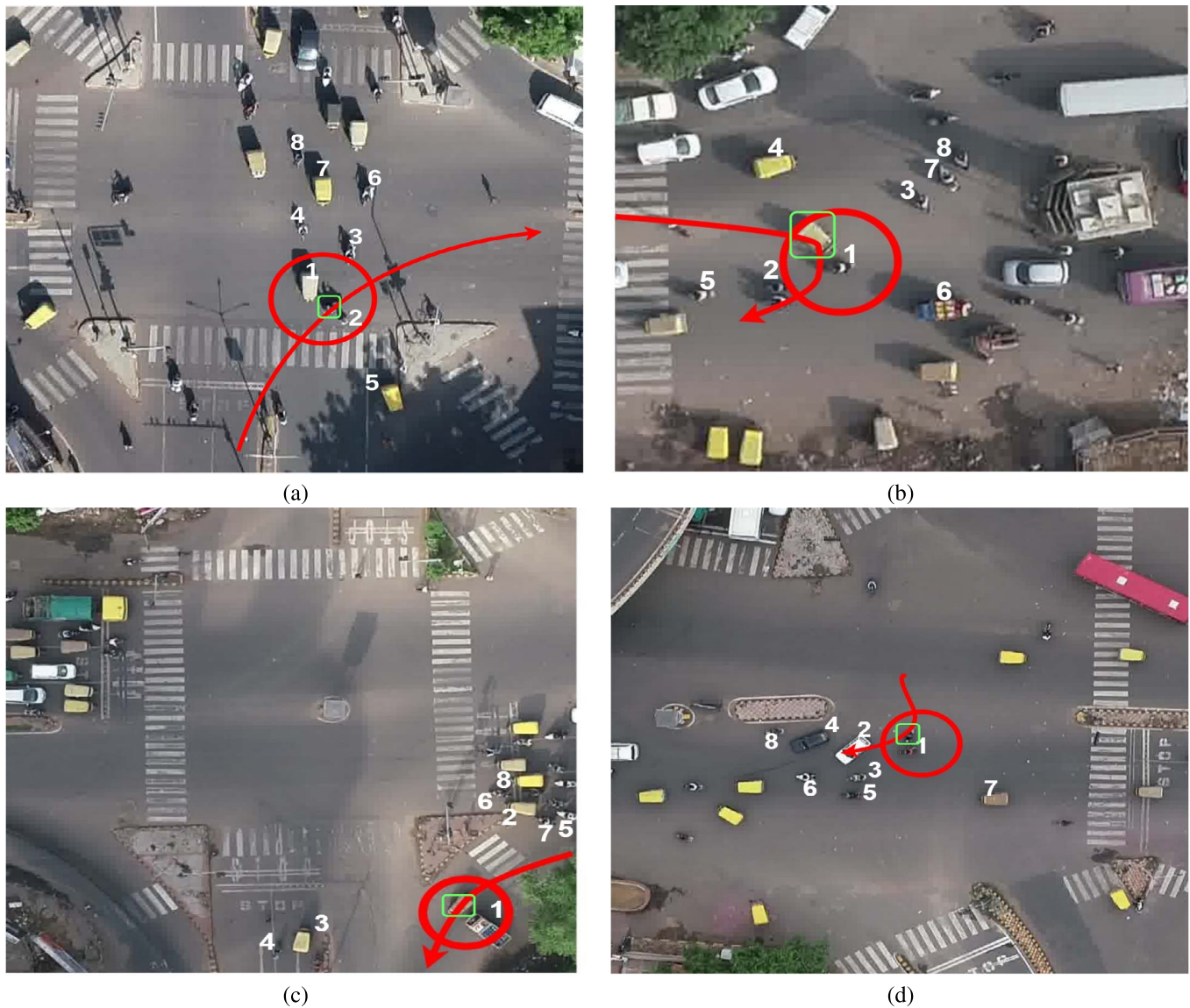
Fig. 4. Examples of unsafe interaction trajectories in SkyEye dataset at various intersections - (a) P, (b) A, (c) N, and (d) V. The vehicle whose interaction trajectory is under consideration is shown in green and its neighbors for that particular instant are shown with numbers in white. The trajectory is shown in red and an unsafe interaction is marked in red.