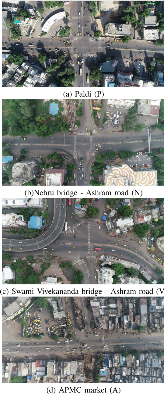
Fig. 2. Intersections in the SkyEye dataset at Ahmedabad in India with their initials in brackets which is used in the rest of the paper. Best viewed in color.