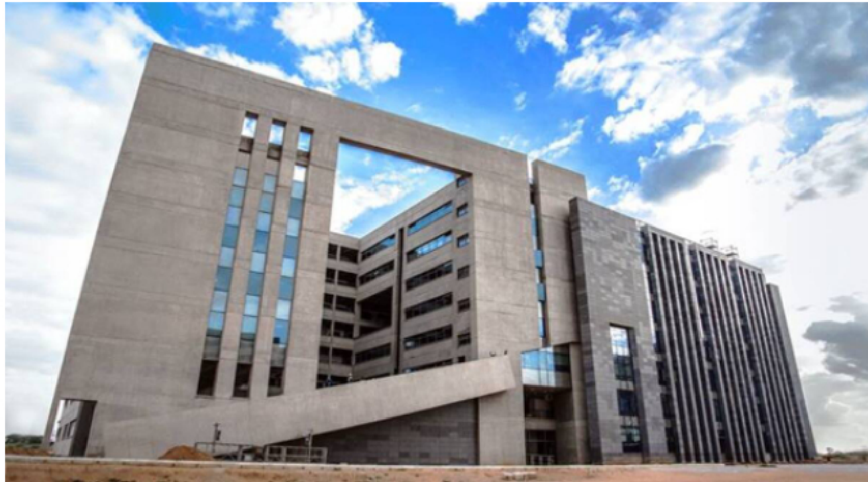
IIT-Hyderabad building. (File)