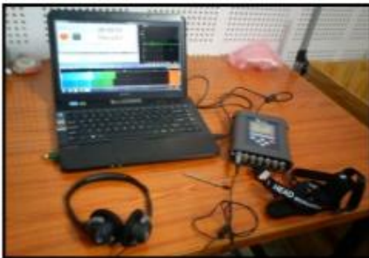
Figure 3. Jury evaluation experiment test setup

In the present analysis, only one bipolar variable data namely pleasant/unpleasant has been chosen for further statistical processing as described in the subsequent sections.