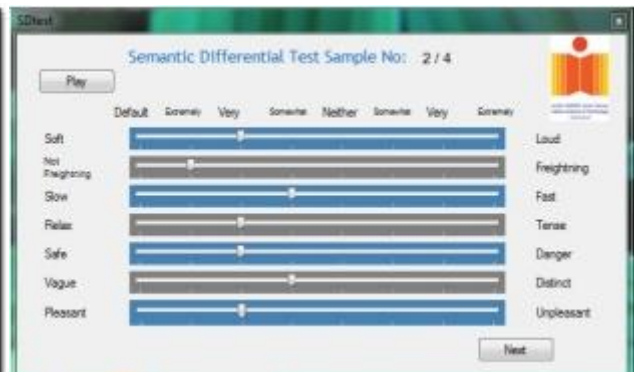
Figure 4. Snapshot of GUI for subjective pleasantness test