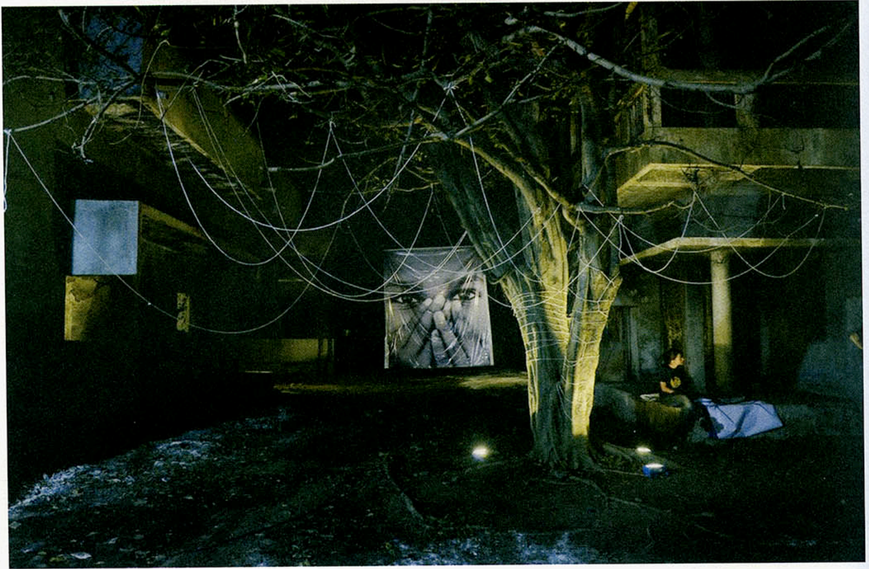
Installation by chinar